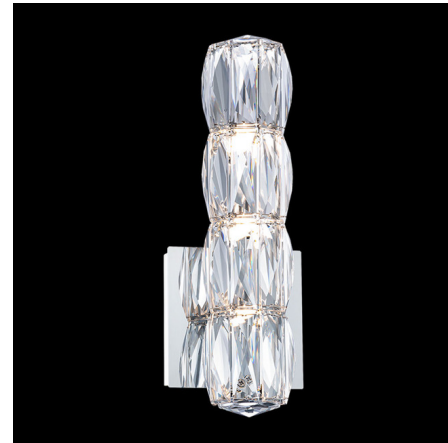
Shown in stainless steel / radiance crystal

Notes: Color temperature adjustability switch from 3000K/3500K/4000K at time of installation mounted at the back of the mounting plate to be installed within the junction box. Dimmable with Triac (Standard), Low Voltage Electronic, or 0-10V Dimming.