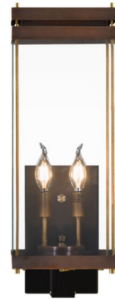
Shown in antique copper / clear

Our Austin lantern is crafted as a wall-mounted lantern, built from solid copper and designed to age gracefully with a natural patina. It provides electric illumination for everyday exterior use and can also be configured with yoke mount, post mount, pier mount to suit a wide range of architectural applications.