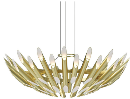
Shown in satin brass

PRODUCT DIMENSIONS . . . . . Adjustable Cable Length: 240" COLOR RENDERING . . . . . 90 CRI LAMP COLOR . . . . . 3000K LUMENS/WATT . . . . . 6,600.00 LUMINOUS FLUX . . . . . 10560 lumens