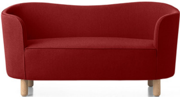
Shown in: Natural Oak / Vidar 582

The Mingle Sofa was designed by Danish architect Flemming Lassen in 1935 and presented at the Copenhagen Cabinetmakers' Guild Competition the same year. Inspired by French elegance and Italian modernism that Lassen witnessed during his travels through Europe, the Mingle Sofa was created with conversation in mind. Curving armrests encircle the sitters to create a comfortable and intimate atmosphere. Rounded solid oak legs complete the look, and petite proportions allow Mingle to fit easily in a variety of interiors. The Hallingdal 65 573 and Vidar 323 fabrics are not available with natural oak finish.