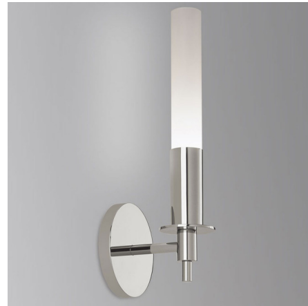
Shown in polished nickel / etched glass