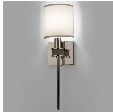
Shown in polished nickel / sage shagreen

The Topanga I Wall Sconce features a sleek metal frame capped by a neatly tailored linen shade or sleek metal shade. The sconce's thin vertical stem is accented by a decorative collar in wood or dyed shagreen for an understated but richly textured decorative touch. Available with a half-shade for ADA-compliant applications (4 inch depth) or a full cylinder shade (6.125 inch depth). Note: The Metal Shade option is only available with a full cylinder shade (6.125 inch depth)