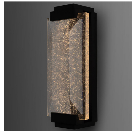
Shown in blackened brass

The Alex Wall Sconce features a faceted cast glass diffuser inspired by the elegant appearance of a cut gem in a piece of jewelry. The glass is lit from the edges by integrated LED light sources, illuminating the sconce with a warm glow that will transform any space.