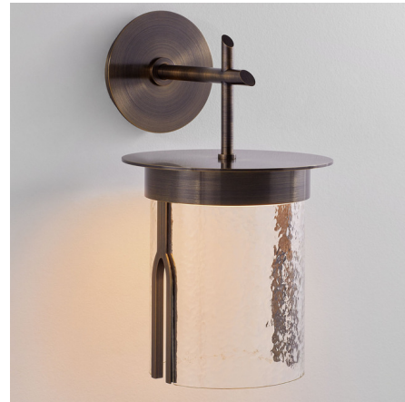
Shown in antiqued boyd brass / textured clear

The Duet Wall Sconce features a cylindrical glass diffuser with narrow, arching cutouts in the side to create a visual focal point and use negative space to create presence from absence. The textured art glass adds a tactile element to the clean-lined, geometric silhouette. LED driver must be mounted remotely.