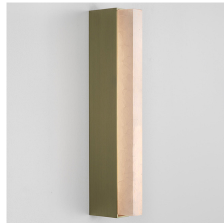
Shown in satin brass / cast rock crystal

Drawing upon European and Japanese influences, the Isa Wall Sconce offers an elegant, minimalistic look that blends form and function. The slim linear frame is paired with a cast glass diffuser in Clear Crystal or Rock Crystal, which adds an intriguing visual texture. The glass is gently illuminated by integrated LEDs for high performance, energy efficient lighting. Note: Due to the fixture's slim profile, mudding-in is required for installation. A 3.5 inch mudding plate is included. LED driver must be installed remotely.