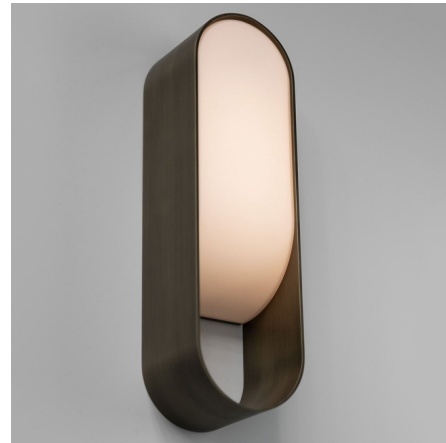
Shown in antiqued boyd brass / white

The Loop Wall Sconce features a gently sloping cased white glass diffuser set within an oblong band of hand-finished brass for a soft, serene expression. The diffuser houses an integrated LED, which provides softened, ambient illumination. Dimmable with Triac, ELV, and 0-10V dimmers.