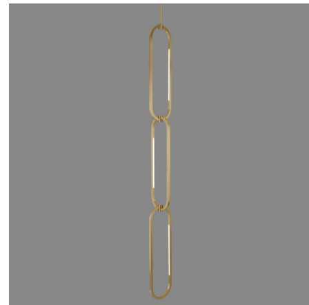
Shown in satin brass

The Ovalo Chain Pendant features a trio of oblong links joined together like a chain for an open, airy expression. The links are formed from square tubes and are illuminated from within by integrated LEDs beneath satin white diffusers. The pendant is available with three 24 or 36 inch loops (69 inch height or 100 inch height, respectively). The maximum overall hanging height including downrod is specified to order: 78 to 120 inches (69 inch pendant) and 120 to 162 inches (100 inch pendant).