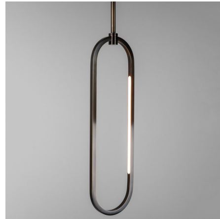
Shown in antiqued boyd brass

The Ovalo Pendant features an oblong frame with a thin profile for an open, airy expression. The pendant is formed from a bent square tube and is illuminated from within by an integrated LED beneath a satin white diffuser. The maximum overall hanging height including downrod is specified to order: 30 to 54 inches (24 inch pendant) and 42 to 66 inches (36 inch pendant).