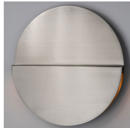
Shown in satin nickel

The Plateau Wall Sconce features a slim profile illuminated by an integrated LED to produce a warm, ambient glow. Plateau's elemental, geometric form and shallow projection allow it to effortlessly blend into a wide variety of decor styles. Note: All sizes of the round sconce and the 6 inch square sconce require the LED driver to be mounted remotely. The square 10 and 14 inch sconces require a 3.5 inch octagonal junction box or for the driver to be mounted remotely.