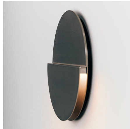
Shown in antiqued boyd brass