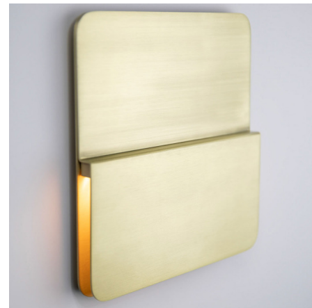
Shown in satin brass

The Plateau Outdoor Wall Sconce features a slim profile illuminated by an integrated LED to produce a warm, ambient glow. Plateau's elemental, geometric form and shallow projection allow it to effortlessly blend into a wide variety of decor styles. Note: LED driver must be installed remotely. The sconce must be installed with the light source aimed downward for UL Wet Location compliance.