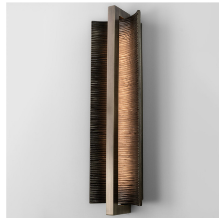
Shown in antiqued boyd brass