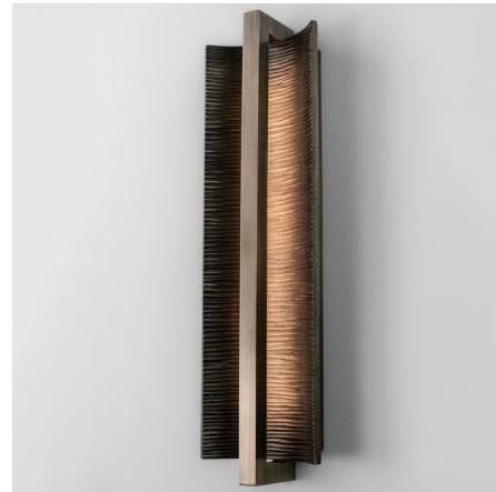
Shown in antiqued boyd brass