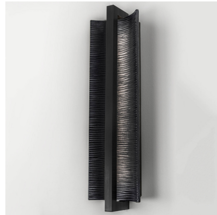
Shown in blackened brass