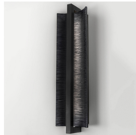
Shown in blackened brass

PRODUCT DIMENSIONS . . . . . Backplate: 4.375"W x 21.25"H COLOR RENDERING . . . . . 90 CRI LAMP COLOR . . . . . 2700K LUMENS/WATT . . . . . 64.71 LUMINOUS FLUX . . . . . 1100 lumens