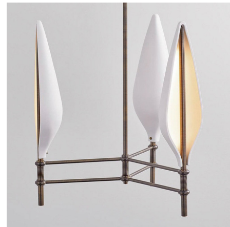
Shown in antiqued boyd brass / white

The Spire Pendant draws upon architectural influences to create an elegant, sculptural expression. The pointed porcelain shades are inspired by towering church steeples and are supported by a triangular frame of turned brass rods. Integrated LED light sources within the rods direct light into the shade, which then reflects outwards to provide pleasant ambient lighting. Overall height specified to order: 30 inch minimum to 60 inch maximum.