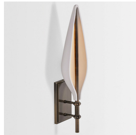
Shown in antiqued boyd brass / white

The Spire Wall Sconce draws upon architectural influences to create an elegant, sculptural expression. The pointed porcelain shade is inspired by towering church steeples and is supported by turned brass bracket arm. An integrated LED light source within the brass rod directs light into the shade, which then reflects outwards to provide pleasant ambient lighting. Note: For installation, the sconce requires a deep 3.5 inch octagonal j-box or the driver must be mounted remotely.