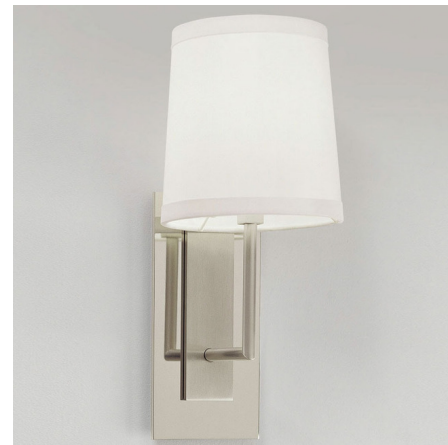
Shown in polished nickel / satin nickel / white linen

The Belmont Wall Sconce offers a clean-lined, traditional design that will complement a wide variety of decor styles in residential, commercial, and hospitality spaces alike. The tapered linen shade is supported by a bracket arm extending from a two-toned backplate of satin and polished nickel. Available with a half-shade for ADA-compliant applications (3.9 inch depth) or a full shade (8 inch depth).