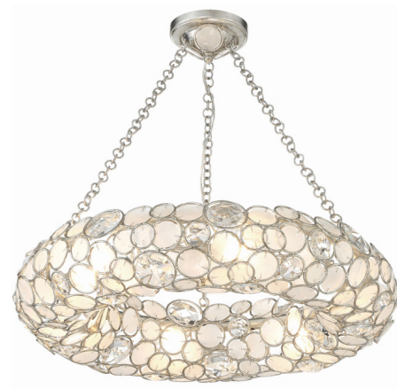
Shown in antique silver / crystal

The Palla Ring Chandelier is fitted with different sized round, hand-pinned, organic, and naturally textured Capiz shells, creating a unique texture and sparkle that play with the interplay of light and shadow. Faceted cut crystal jewels nestled within overlapping metal circles offer depth and dimension, elevating the chandelier into a work of art. Its open-ring design at the top directs light upward, creating a warm and inviting ambiance, and casts a gentle, downward glow. The same enchanting Capiz shells and crystal details that grace the fixture are mirrored on the canopy, ensuring that every aspect of the Palla Ring Chandelier exudes a sense of organic luxury and sophistication.