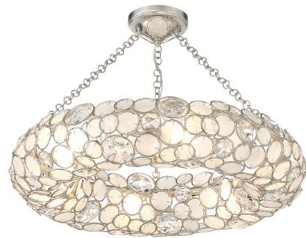
Shown in antique silver / crystal

The Palla Ring Convertible Ceiling Light is fitted with different sized round, hand-pinned, organic, and naturally textured Capiz shells, creating a unique texture and sparkle that play with the interplay of light and shadow. Faceted cut crystal jewels nestled within overlapping metal circles offer depth and dimension, elevating the chandelier into a work of art. Its open-ring design at the top directs light upward, creating a warm and inviting ambiance, and casts a gentle, downward glow. The same enchanting Capiz shells and crystal details that grace the fixture are mirrored on the canopy, ensuring that every aspect of Palla exudes a sense of organic luxury and sophistication. Can be converted from semi flush to pendant.