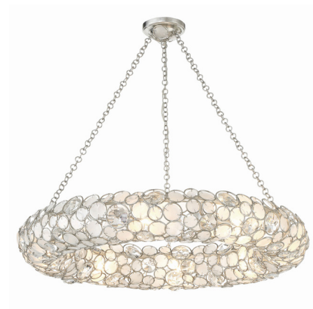
Shown in antique silver / crystal

COLOR Crystal BODY FINISH Antique Silver WATTAGE 480W DIMMER Standard 120V DIMENSIONS 32"W x 5.25"H BULB NOT INCLUDED 8 x B10/Candelabra (E12)/60W/120V Incandescent OTHER BULB OPTIONS 8 x B10/Candelabra (E12)/120V LED COUNTRY OF ORIGIN China