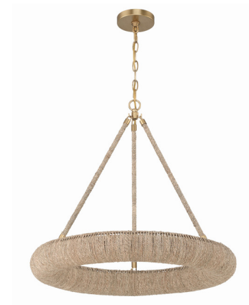
Shown in gold / natural

PRODUCT DIMENSIONS . . . . . Chain Length: 72" COLOR RENDERING . . . . . 80 CRI LAMP COLOR . . . . . CCT Select LUMENS/WATT . . . . . 6.33 LUMINOUS FLUX . . . . . 190 lumens