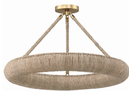
Shown in gold / natural