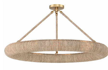
Shown in gold / natural

COLOR RENDERING . . . . . 80 CRI LAMP COLOR . . . . . CCT Select LUMENS/WATT . . . . . 114.29 LUMINOUS FLUX . . . . . 400 lumens