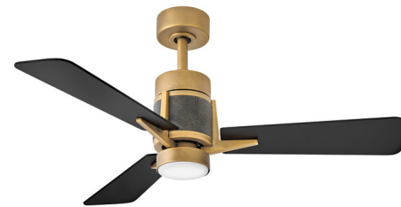
Shown in heritage brass / matte black

LAMP LIFE . . . . . 50000 hours COLOR RENDERING . . . . . 90 CRI LAMP COLOR . . . . . 3000K Warm Dim LUMENS/WATT . . . . . 82.50 LUMINOUS FLUX . . . . . 1320 lumens