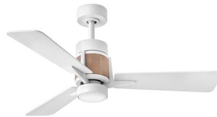
Shown in matte white / matte white