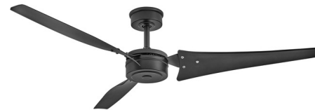
Shown in matte black / matte black

BLADE COLOR Matte Black BODY FINISH Matte Black WATTAGE N/A DIMMER N/A DIMENSIONS 60"W x 12.25"H BULB N/A COUNTRY OF ORIGIN China