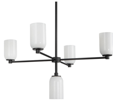
Shown in black / opal

The Nola Chandelier brings a sleek, modern look to your interior space. The smooth steel frame holds dome shaped steel or glass shades that casts light upwards and downwards across your room. Sloped ceiling compatible up to 45 degrees.