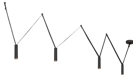
Shown in urban bronze / clear

PRODUCT DIMENSIONS . . . . . Adjustable Strap Length: 120" LAMP LIFE . . . . . 50000 hours COLOR RENDERING . . . . . 90 CRI LAMP COLOR . . . . . 3000K LUMENS/WATT . . . . . 50.54 LUMINOUS FLUX . . . . . 1870 lumens