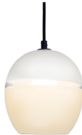
Shown in black / white / ivory

PRODUCT DIMENSIONS . . . . . Adjustable Fabric Cord Length: 72" COLOR RENDERING . . . . . 90 CRI LAMP COLOR . . . . . 2700K LUMENS/WATT . . . . . 87.50 LUMINOUS FLUX . . . . . 350 lumens