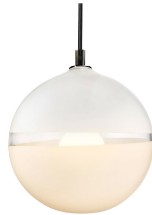
Shown in black / white / ivory

PRODUCT DIMENSIONS . . . . . Adjustable Fabric Cord Length: 72" COLOR RENDERING . . . . . 90 CRI LAMP COLOR . . . . . 2700K LUMENS/WATT . . . . . 87.50 LUMINOUS FLUX . . . . . 350 lumens