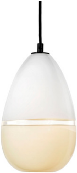
Shown in: Black / White / Ivory

The Lattimo Teardrop Pendant is a variation on the banded line, these pieces focus on their forms rather than the juxtaposition of colors. The name refers to the Italian technique of lattimo or milk glass. Two opaque swathes of color are wrapped around a clear crystal bubble. Made in California and signed by Caleb and Carmen. Note: Each piece of hand-blown glass is a unique work of art. Dimensions, weight, and color will vary. When multiple fixtures are installed next to each other, expect some variation in shape and color.