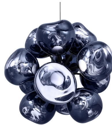
Shown in black / smoke

COLOR RENDERING . . . . . 90 CRI LAMP COLOR . . . . . 3000K LUMENS/WATT . . . . . 1,183.33 LUMINOUS FLUX . . . . . 7100 lumens