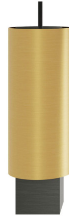
Shown in satin brass outer shade & canopy / satin graphite

The Extra Pendant combines overlapping square and round profiles for a new twist on the essential geometries of the rectangle and cylinder. Available with a rectangular or cylindrical exterior and contrasting interior, Extra can be used to create intriguing geometric installations, particularly in a grouping of multiple pendants. Ceiling canopy matches exterior finish.