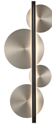
Shown in satin graphite / satin nickel

The Strate Moon Wall Sconce features a grouping of brass discs linked by an illuminated linear frame. Strate's large size and modern geometric aesthetic give it a sculptural expression that will anchor any space's decor as an eye-catching centerpiece. Includes 4.7 inch W wall plate to cover standard US junction box (not pictured).