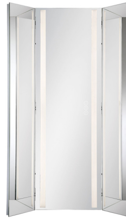
Shown in chrome