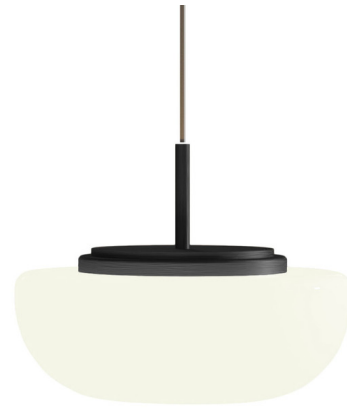
Shown in anthracite / satin opal

COLOR RENDERING . . . . . 90 CRI LAMP COLOR . . . . . 2700K LUMENS/WATT . . . . . 110.00 LUMINOUS FLUX . . . . . 550 lumens