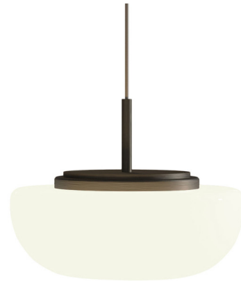
Shown in brushed bronze nickel / satin opal

COLOR RENDERING . . . . . 90 CRI LAMP COLOR . . . . . 2700K LUMENS/WATT . . . . . 110.00 LUMINOUS FLUX . . . . . 550 lumens