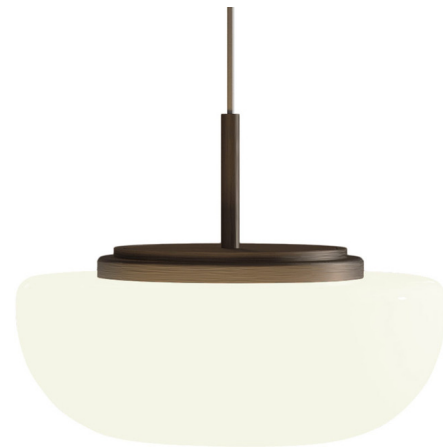
Shown in brushed bronze nickel / satin opal

COLOR RENDERING . . . . . 90 CRI LAMP COLOR . . . . . 2700K LUMENS/WATT . . . . . 110.00 LUMINOUS FLUX . . . . . 550 lumens