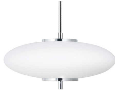
Shown in polished chrome / opal white

PRODUCT DIMENSIONS . . . . . Downrods Included: 1-8", 1-11", and 1-20" Stems LAMP LIFE . . . . . 30000 hours COLOR RENDERING . . . . . 90 CRI LAMP COLOR . . . . . 3000K LUMENS/WATT . . . . . 54.83 LUMINOUS FLUX . . . . . 1316 lumens