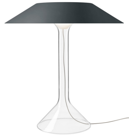
Shown in clear / grey

COLOR RENDERING . . . . . 90 CRI LAMP COLOR . . . . . 2700K LUMENS/WATT . . . . . 120.00 LUMINOUS FLUX . . . . . 900 lumens