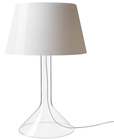
Shown in clear / warm white

COLOR RENDERING . . . . . 90 CRI LAMP COLOR . . . . . 2700K LUMENS/WATT . . . . . 120.00 LUMINOUS FLUX . . . . . 900 lumens