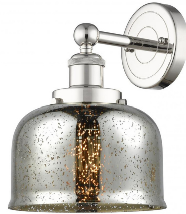
Shown in polished nickel / mercury

The Bell Stem Wall Sconce adds a clean, industrial look to your interior space. The smooth arm holds an retro lamp socket that is surrounded by dome shaped glass that is flared at the bottom, casting warm shadows across your room.