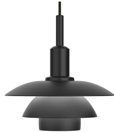
Shown in black / black