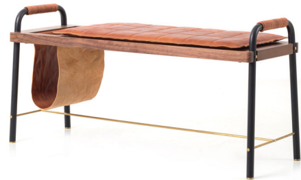
Shown in black / saddle leather

The Valet Bench is perfect for seating and features a sleek tubular design that is enhanced by the warming touch of walnut and padded leather seat. a leather magazine rack is attached to the underside.