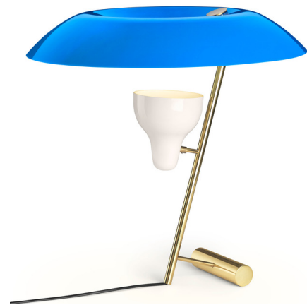
Shown in azure / polished brass

Originally designed by Gino Sarfatti in 1951, the Model 548 Table Lamp is an exercise in reflected and diffused light. The lamp's thin brass stem supports an adjustable spotlight which is aimed towards an indented methacrylate shade. The shade allows light to pass through itself as well as reflect back downwards, creating a unique lighting effect. An integrated LED light source and built-in touch dimmer provide a functional modern update to this timeless design.