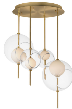
Shown in natural aged brass / clear