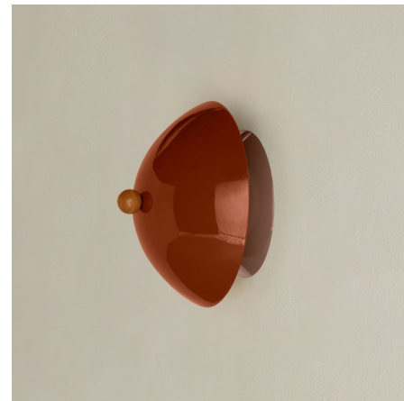
Shown in earth

The Ridge Surface Mount from In Common With is a unique, saucer-shaped light fixture designed for versatility. Made of painted metal, it can be mounted on walls or ceilings and is suitable for both indoor and outdoor environments, adding a touch of intrigue to any space. ELV/TRIAC/0-10V dimmable.