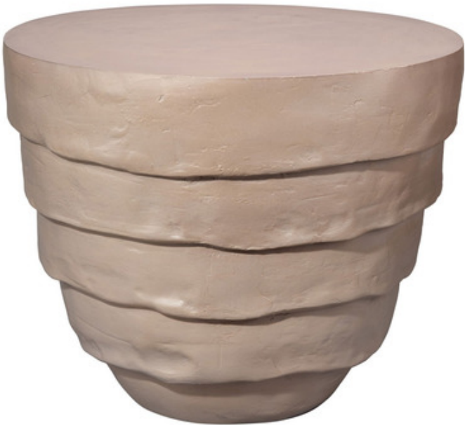
Shown in: Rustic Cement

Organically inspired, these captivating Concentric Accent Table are distinguished by their undulating, amorphous shapes and soft, easily integrated finishes. Each is artisan-crafted of fiberglass and finished by hand. They make an inspired addition to modern decors and pair beautifully with the new neutral palettes.